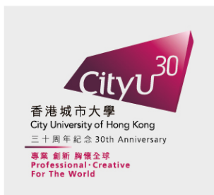
Application on light to medium tone background