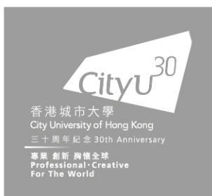
Application on light to medium tone background