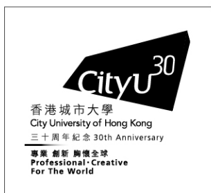
Application on white Background