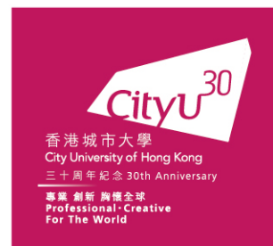
Application on dark Background