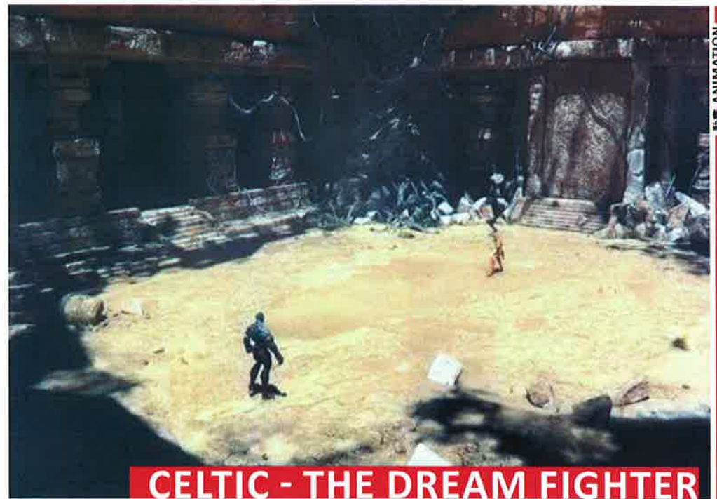
CELTIC - THE DREAM FIGHTER