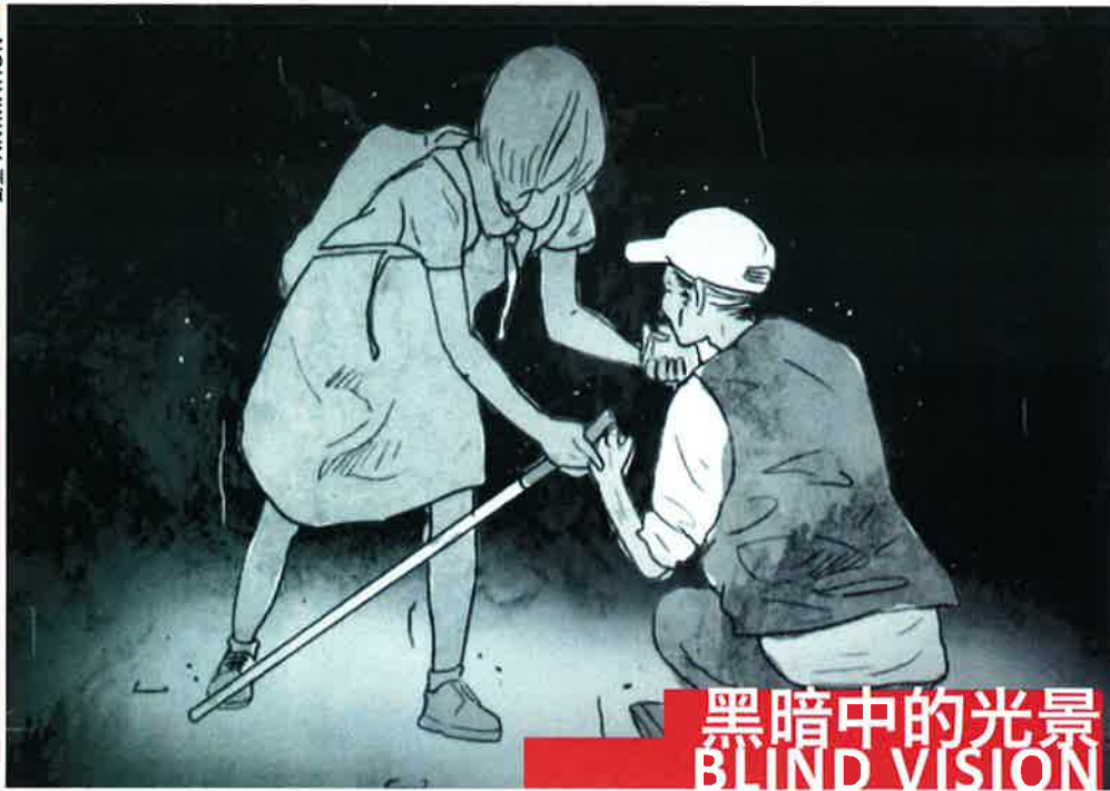
黑暗中的光景 BLIND VISION