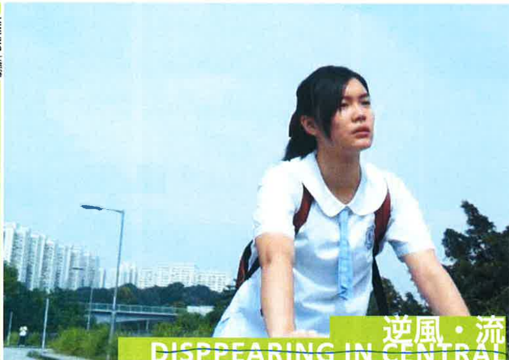
逆風·流 DISAPPEARING IN CENTRAL