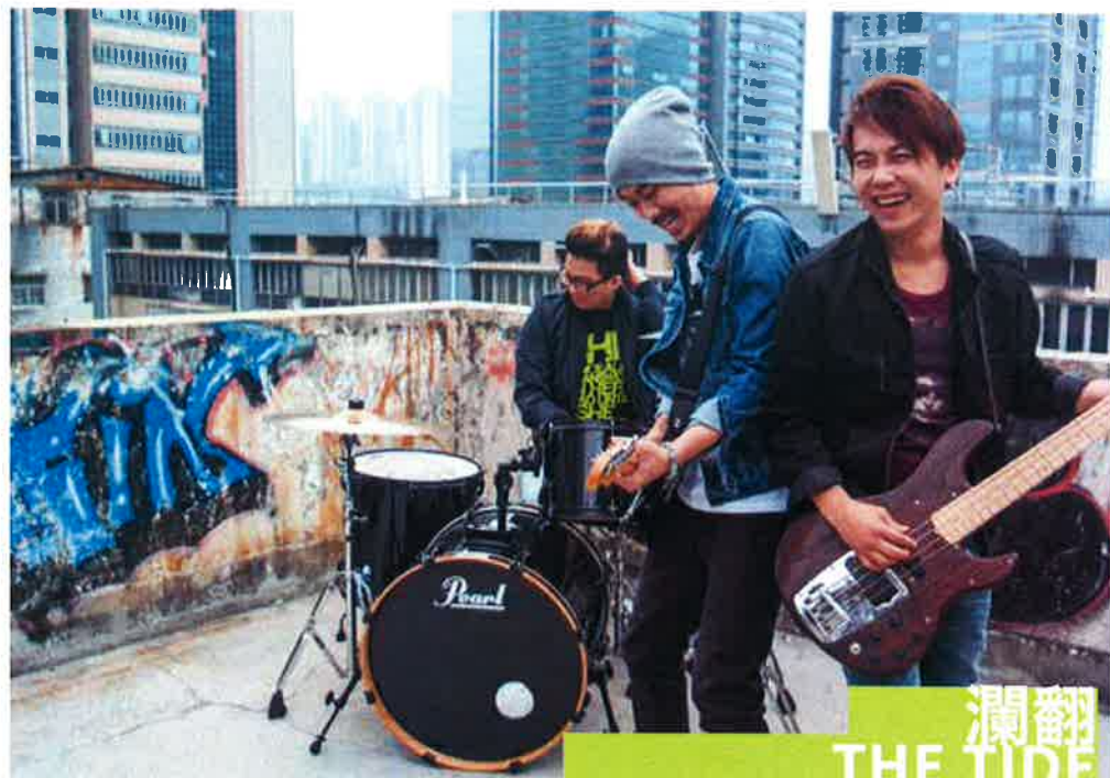
瀾翻 THE TIDE