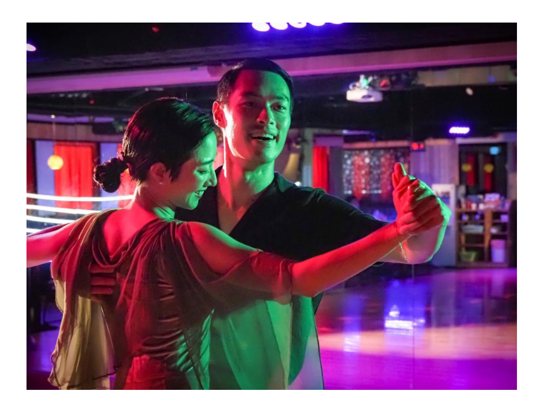
2020 / 115 min. / Drama, Romance / Taiwan / Color / Mandarin Chinese