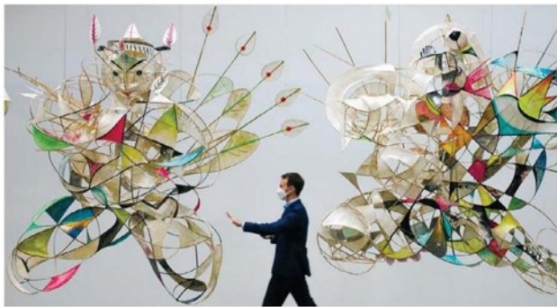
Art Central is back and unmasked, opening to the public at Hong Kong Convention and Exhibition Centre from tomorrow until Sunday.

Featuring new and historic works from more than 60 artists across Asia and its diasporas, this exhibition explores queer mythologies and is one of the first major exhibitions to do so in the city. Expanding upon the Spectrosynthesis series of exhibitions in Taipei and Bangkok, the Hong Kong