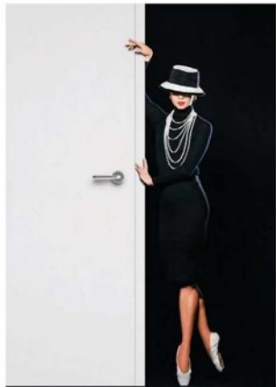
Coco Chanel's story has been brought to the stage in a new production by HK Ballet.

Coco Chanel revolutionised the fashion world, and her iconic creations – the likes of which include the little black dress and bouclé jackets – have stood the test of time. Her story is told through ballet for the first time in this world premiere