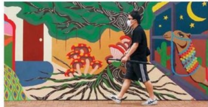
A colourful mural from HKwalls, spotted at last year's event outside the Hong Kong Observation Wheel in Central.

Music fans will be pleased to know that Clockenflap isn't the only festival of this month. More than 70 home-grown acts are performing across West Kowloon Cultural District, including Anson Lo, Janice Vidal, Merry