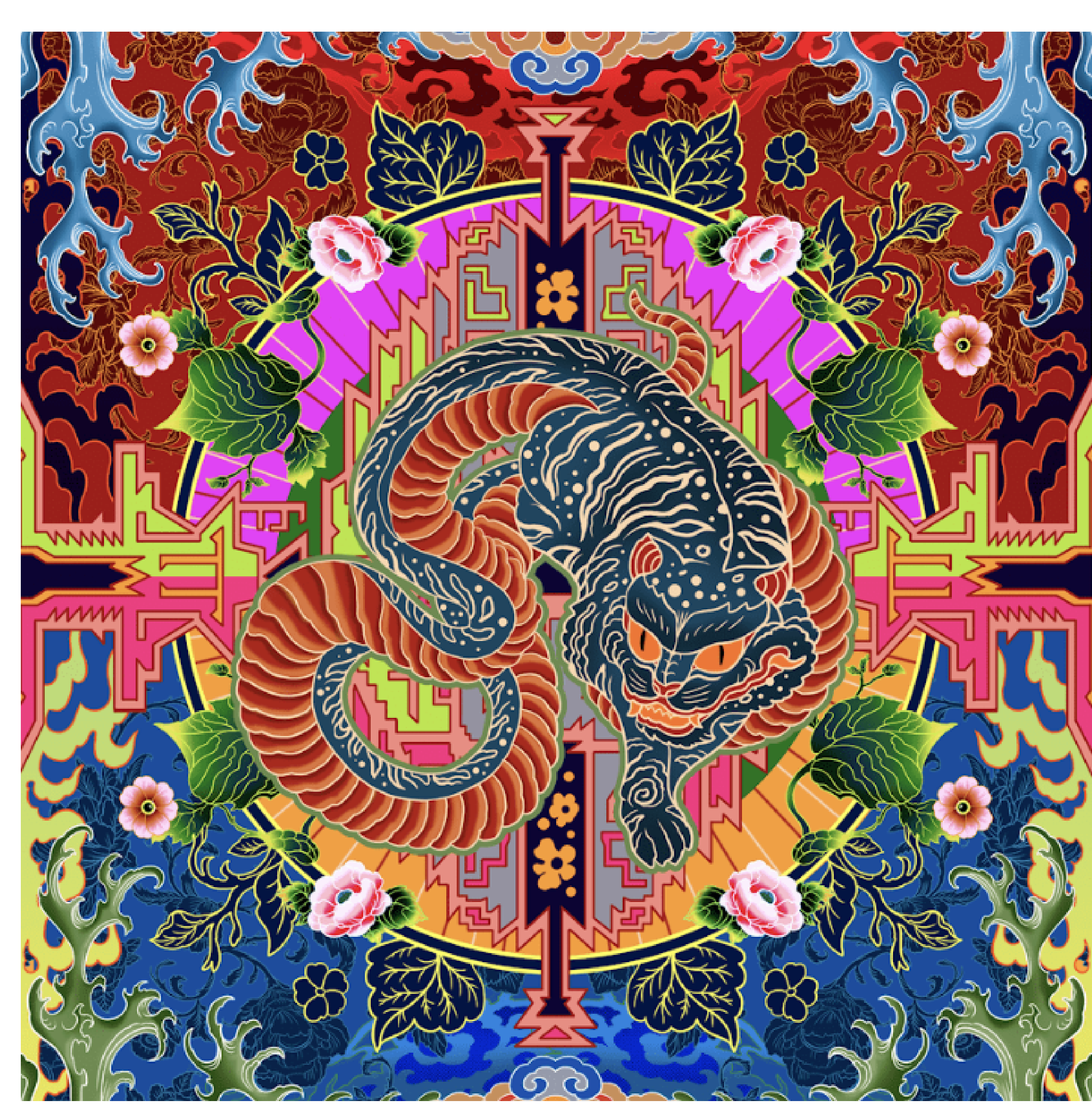
Untitled by Chris Yee, presented by Culture Vault in the Prestige Zone.

Where: 6/F, The Kunsthalle, K11 Art & Cultural Centre, K11 Musea, 18 Salisbury Road, Tsim Sha Tsui When: October 19 – 23