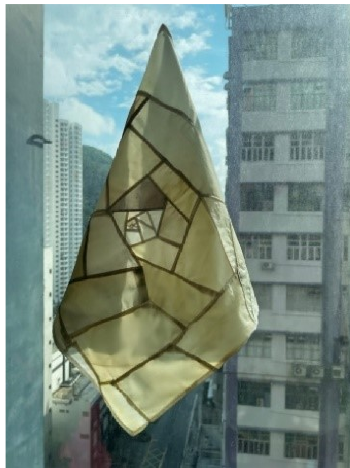
Jaffa Lam, A Piece of Goodbye , 2023

This exhibition features over 200 Hong Kong Art School (HKAS) alumni and artists, with more than 300 remarkable pieces of art across diverse mediums, be it paintings, ceramics or installations. It aims to nurture promising local art talents, which sounds like a great place to find pieces from emerging artists. The fair also hopes to foster the development of the art scene in Hong Kong by serving as a fundraising initiative to support the ongoing programmes and initiatives of HKAS.