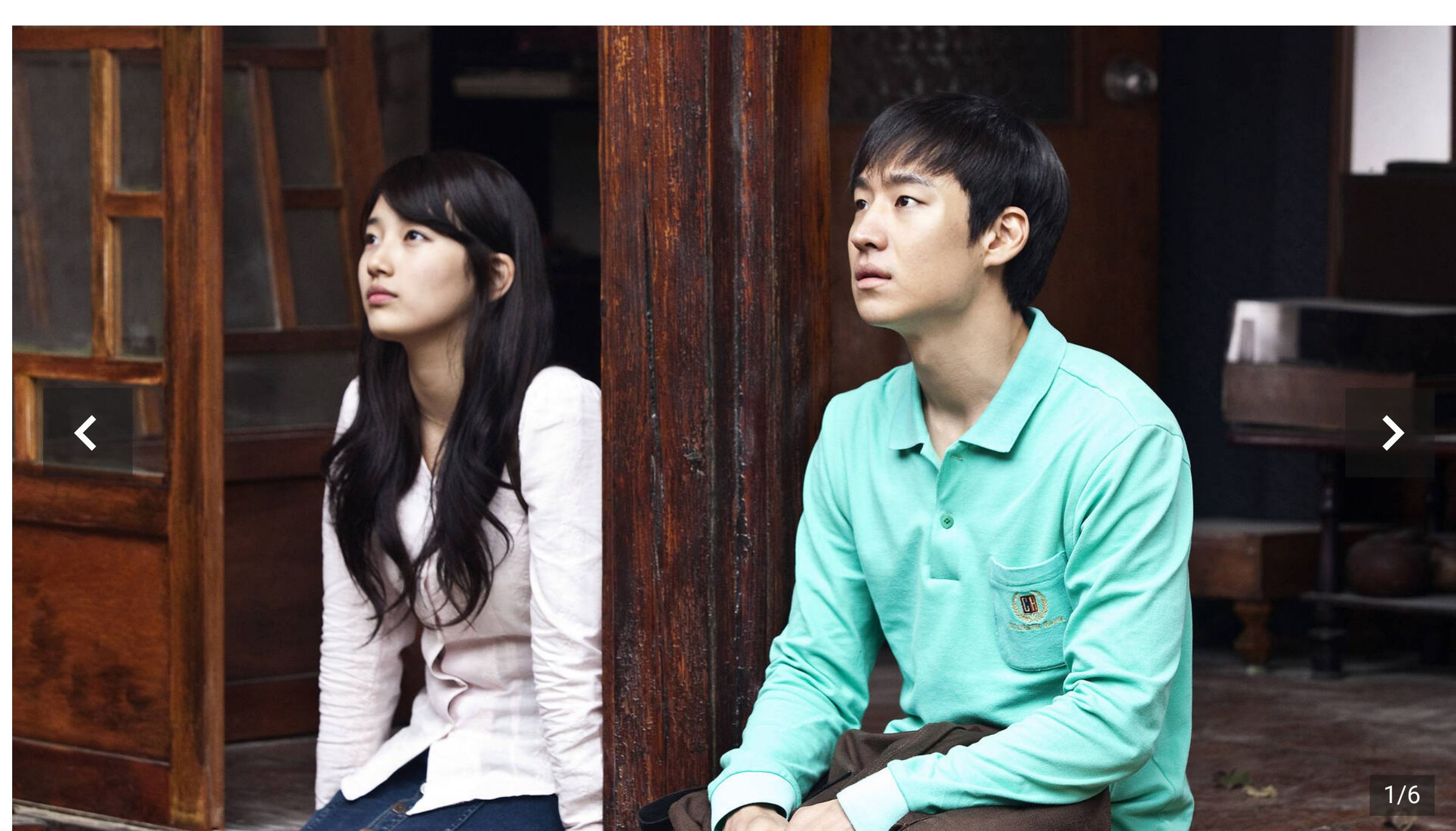
Architecture 101 starring Uhm Tae-wong, Han Ga-in, Lee Je-hoon, and Suzy

Film, Romance Hong Kong Arts Centre, Wan Chai 27 Oct-12 Nov 2023 Recommended