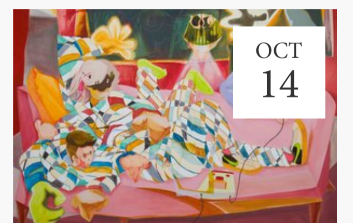
Oct 14 Yutaka Watanabe: Blue Attraction at Gallery Ascend GALLERY ASCEND