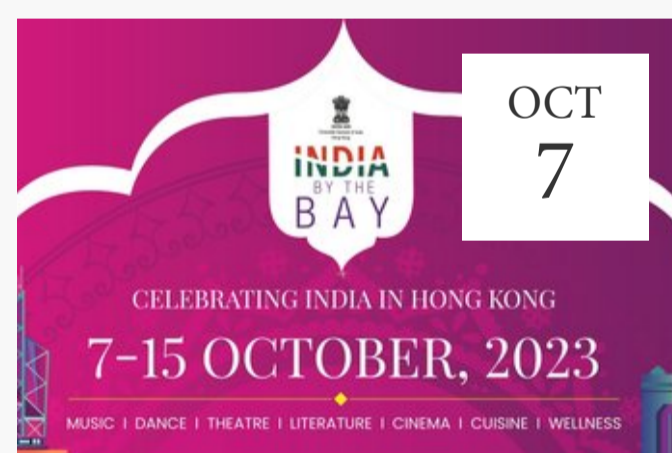
India by the Bay INDIA BY THE BAY, ASIA SOCIETY