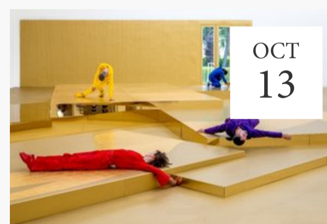
Oct 13 Maria Hassabi: I'll Be Your Mirror at Tai Kwun Contemporary TAI KWUN CONTEMPORARY