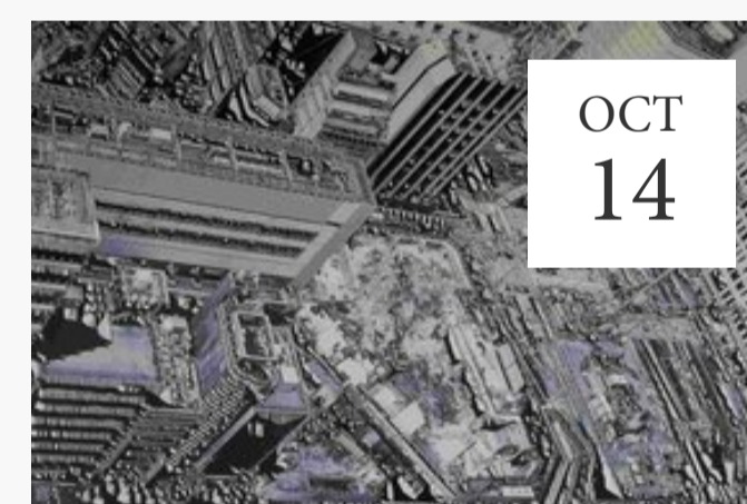
Oct 14 多次元TOKYO at wamono art WAMONO ART