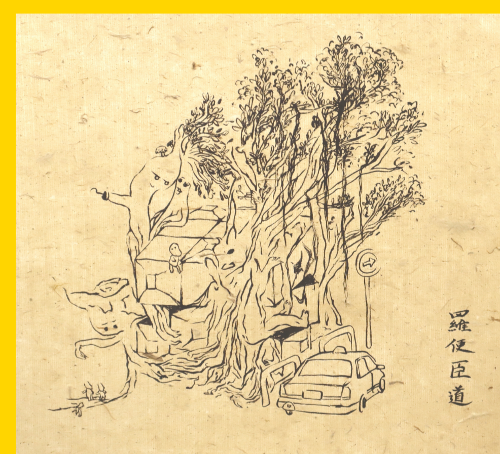
Wenda Yiu: Our Place 2 September - 23 September