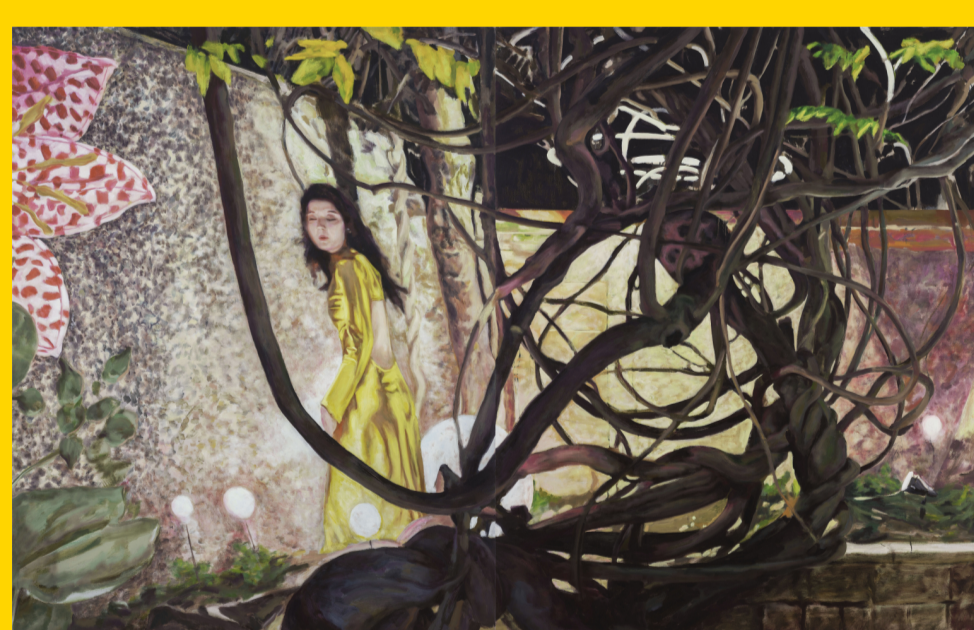
Hao Zecheng: Grand Tour Through the Stars and the Moon 1 September - 10 October