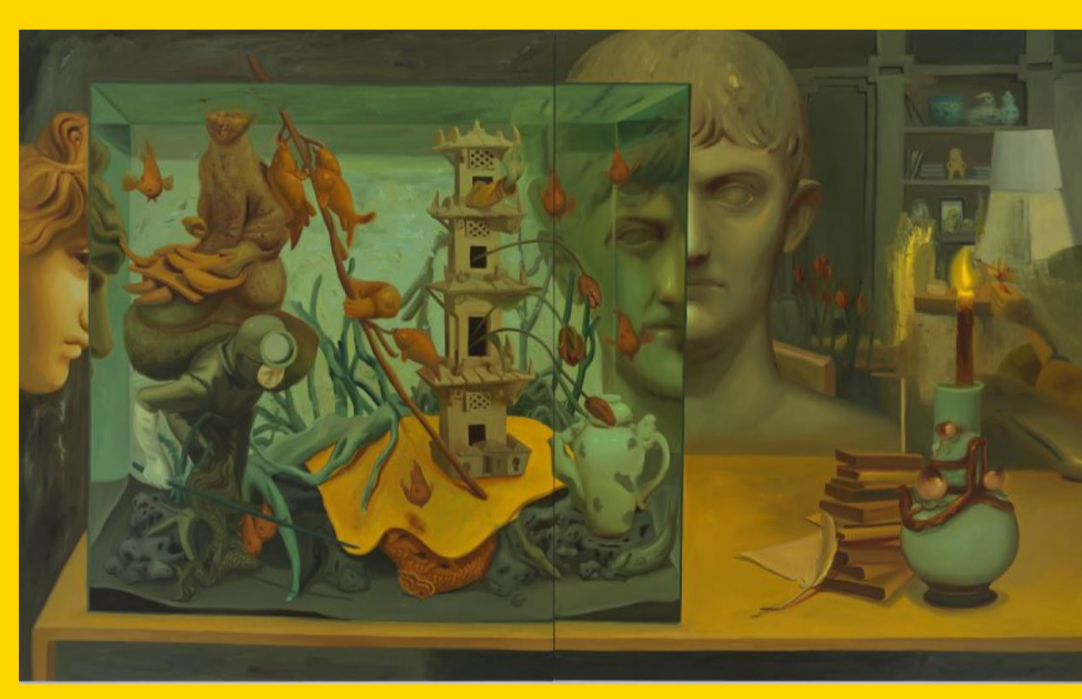
The Descendants 2 September - 17 September