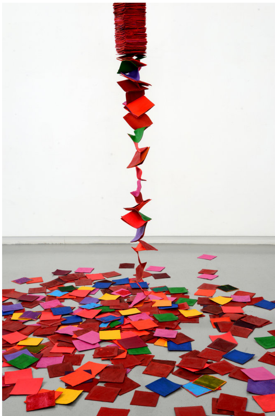
Jane Lee, Stack Up 2 (detail), 2017, acrylic paint on canvas stacked on metal base, 70.5 x 86.6 inches/179x 220 cm

A printed catalogue with an essay by Michelle Ho will accompany the exhibition.