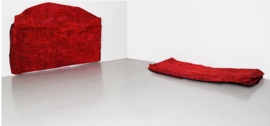
Jane Lee, Red States, 2017, acrylic paint, heavy gel on fiberglass, floor piece: 9.4 x 124 x 61.4 inches/24 x 315 x 156 cm, wall piece: 87.4 x 120.4 x 11 inches/222 x 306 x 28 cm