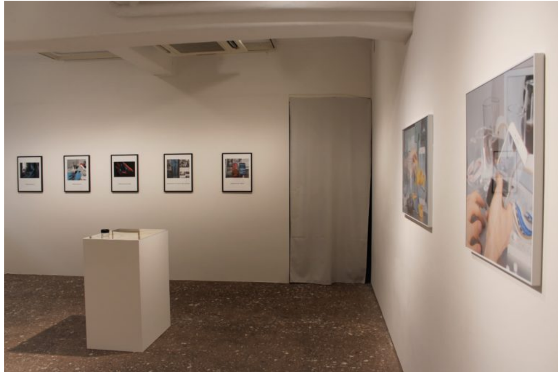
NAGATA Kosuke, Installation View, FALSE SPACES, 2019

Paradoxically the title "FALSE SPACES" seems point out "diversity" the feature of space. Media art is diverse and so does space. Media art can include photography, video, installation and else. Likewise, "space" includes practical space, issues and even abstract space. This connection between media art and space, two main features of the exhibition enrich contents of an exhibition and also it enables an interesting exhibition. Furthermore, a pleasant appreciation will be possible if you focus on these following five concepts Tokyo, Hong Kong, City, Media art, and space. The exhibition "FALSE SPACES" continues from 12 th October to 10 th November. As an associated program, subsequent exhibition is also planned to be held at the Hong Kong Arts Centre symposium in February 2020.