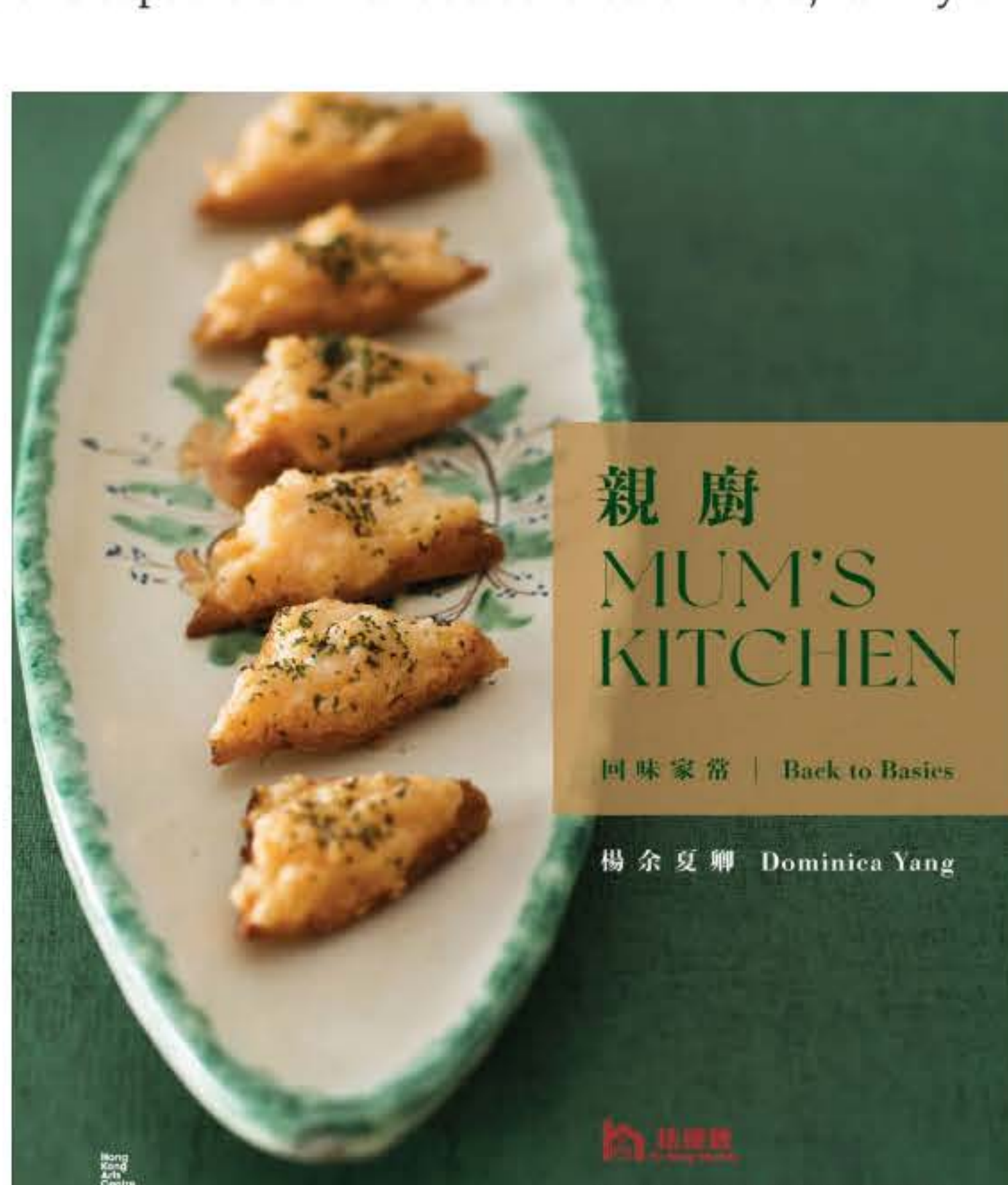
Mum's Kitchen – Back to Basics by Dominica Yang.

Other illustrations capture a childhood centred on food, family and friends.