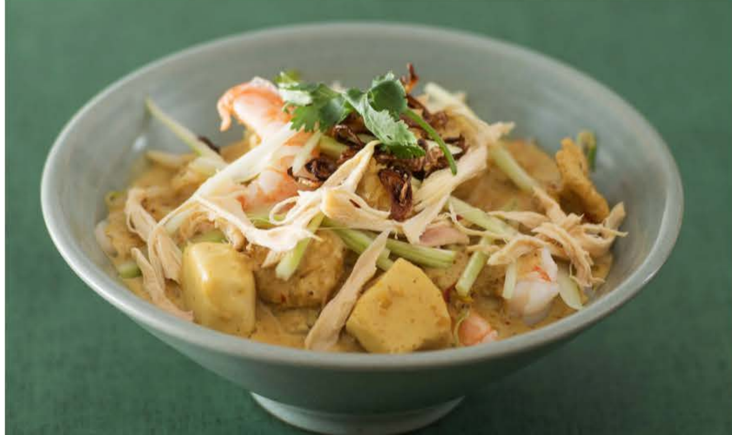
A laksa dish from Mum's Kitchen – Back to Basics.