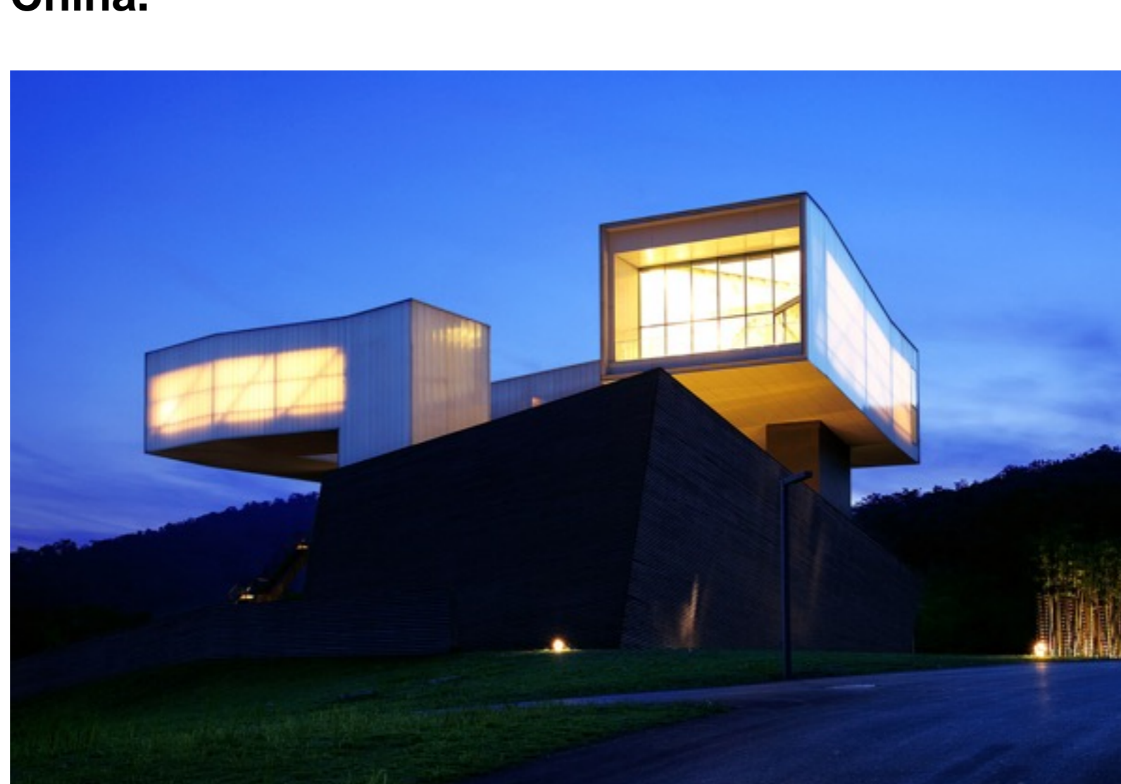
Sifang Art Museum, Steven Holl, 2013, architecture