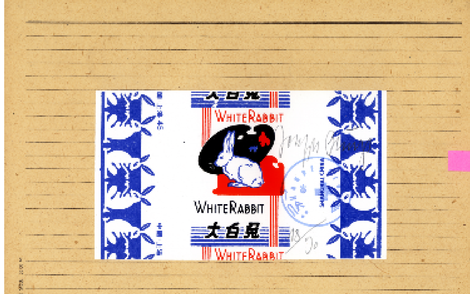
White Rabbit, Joseph Beuys, 1979, colour silkscreen on filing card, stamped, 21 x 29.5 cm

Guan Yi's collection established a professional archive of the Chinese conceptual art development. Among his exhibited collection spanning across the 1970s to the 1990s, He is Himself—Sartre marked the significant trend of artist freeing their minds, shedding light on humanity, opened the entrance of the '85 New Wave.