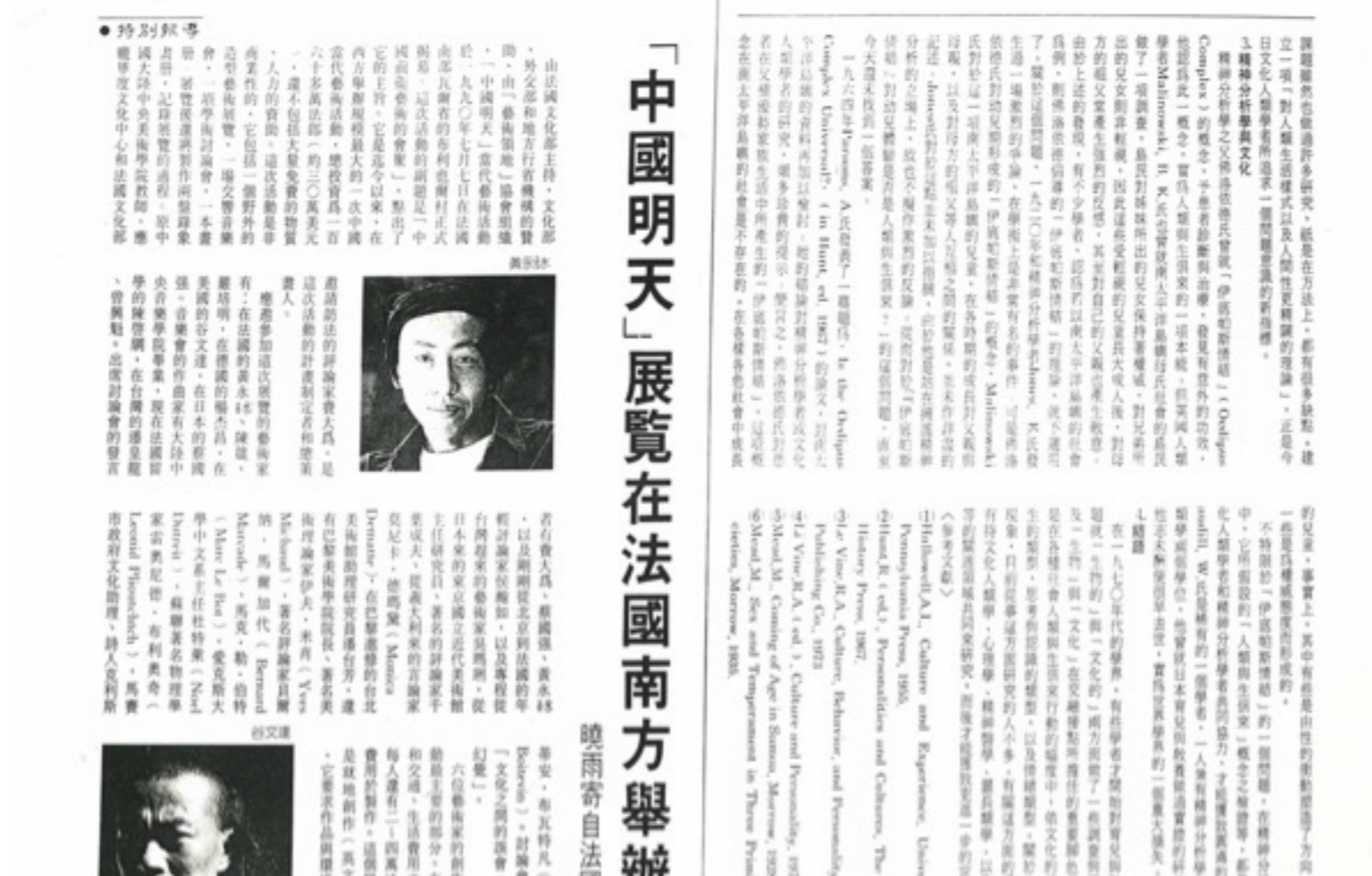
China/Avant-Garde Exhibition, 1989, clipping

Lu Xun is a contemporary art collector, founder and director of Nanjing Sifang Art Museum. In 2003, he invited 24 important Chinese and oversea architects and artists to design and build a series of buildings with unique characteristics. One of the project, Sifang Art Museum is designed by well-known American architect Steven Holl.