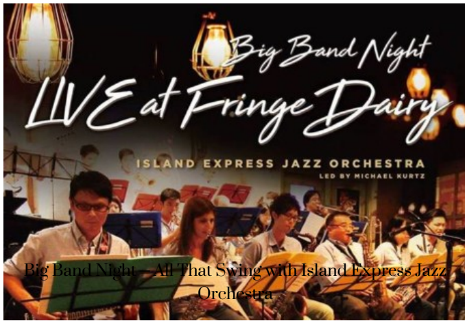
Big Band Night – All That Swing with Island Express Jazz Orchestra