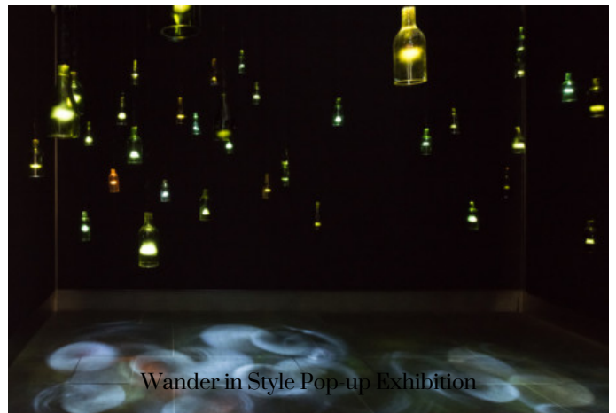
Wander in Style Pop-up Exhibition