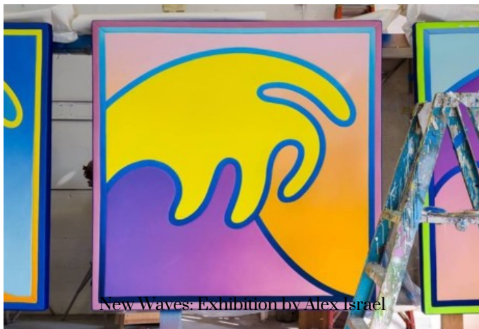
New Waves: Exhibition by Alex Israel